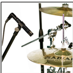
F9 on Cymbal

Cymbals Overheads Hi-Hat Goodie Table Audience mic