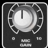
World class Audient mic pre