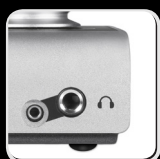
Dual Headphone Outputs