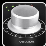
Hardware monitor control