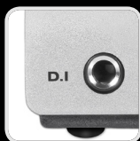
JFET Instrument Input