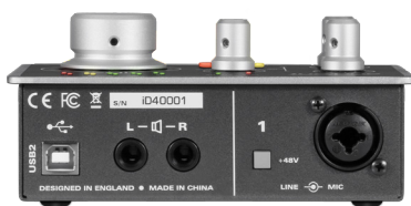
COMPACT DESKTOP ENCLOSURE